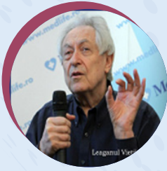
Michel Odent London