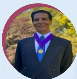
Camran Nezhat USA