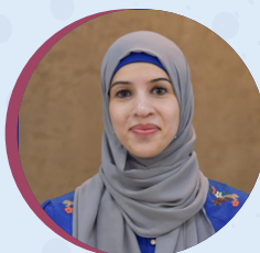
Bedayah amro UAE