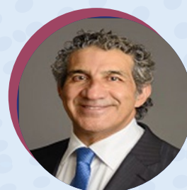
Farr Nezhat USA